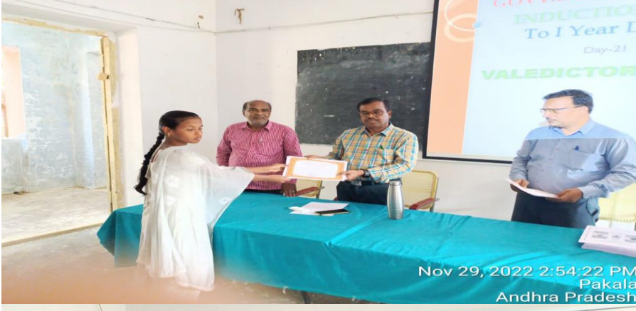
Nov 29, 2022 2:54:22 PM Pakala Andhra Pradesh