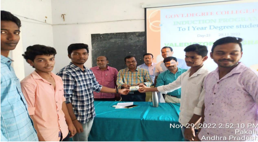
Nov 29, 2022 2:52:10 PM Pakala Andhra Pradesh